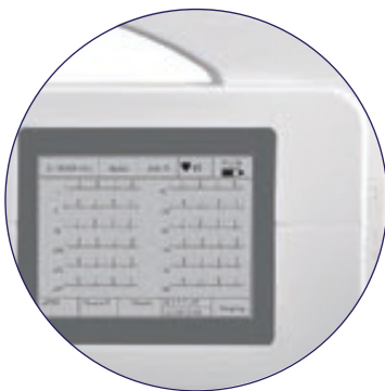
12 Leads Waveforms Display